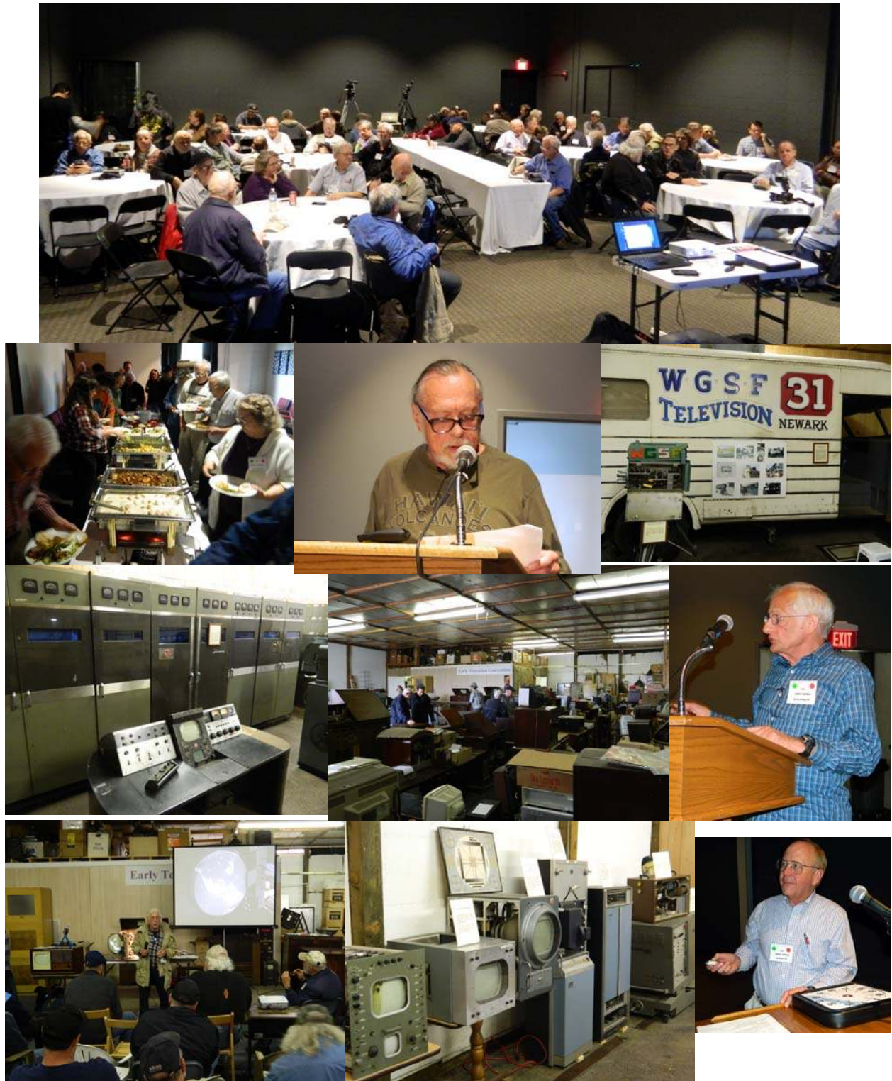
Some Pictures from the 2017 Conference