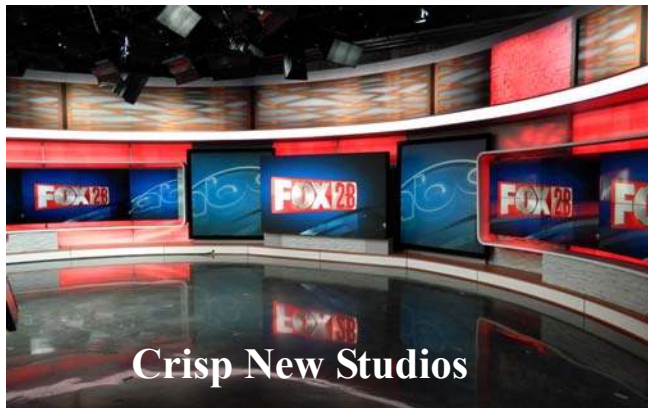
Crisp New Studios