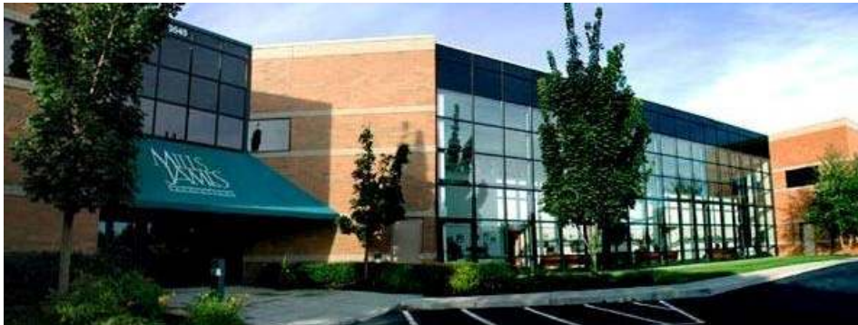
Combined Meeting of SBE Chapter 52 and SMPTE Ohio Section

March 24, 2016, MILLS — JAMES PRODUCTIONS 3545 FISHINGER BLVD. COLUMBUS, OHIO 43026